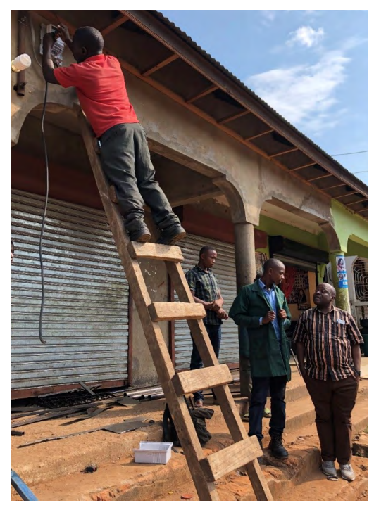
Another home getting access to the national grid in Morogoro region of Tanzania with the help from TANESCO

With these objectives in mind, it was important to ensure that the sampled households for the pretest were of varied character when it came to energy composition. Therefore, both urban and rural Enumeration areas (EAs) were sampled and both EAs with and without access to the national grid. The pretest was conducted in the regions Xai-xai in Mozambique and in Morogoro in Tanzania.