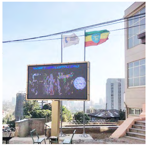
CSA billboard – news updates