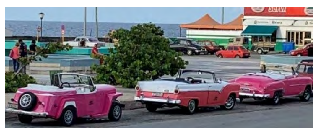
Old cars in Havana

Today Cuba produces a limited amount of oil onshore. In 2018, the oil production was about fifty thousand barrels per day. In June 2019, Cuba launched its first offshore licensing round for blocks in the Cuban Economic Exclusive Zone in the Gulf of Mexico, calling on oil companies, operators and non-operators to bid for available blocks under the Production Sharing Agreement.