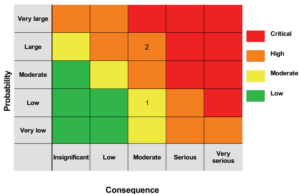
Risk map for capacity and competence in the transfer project

Risks • The risk that employees leave or are absent for various reasons (1 in the figure). • Lack of capacity as a result of production stops in the statistics work plus competing projects/activities in both institutions (2 in the figure).